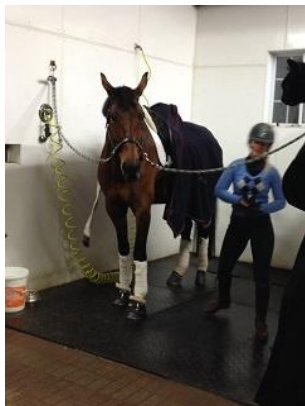
Cool down & Spa treatment