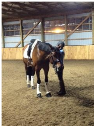
Post Workout Pat