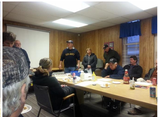
Splash pad discussions