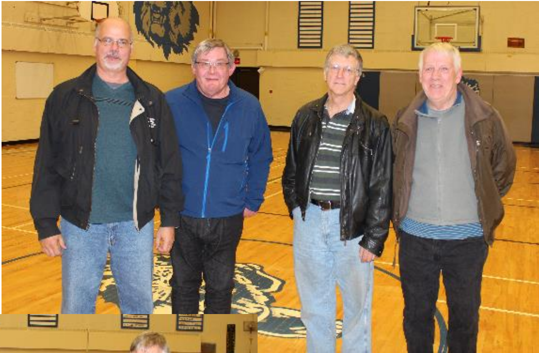
Quiz Night Winning Team, they donated their winnings back to our Kiwanis projects!