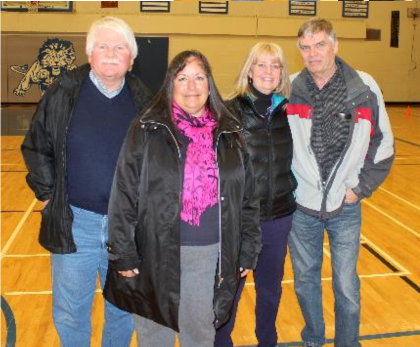
Quiz night Third Place team!

Can the club please help me with the names of the winners? I thought we would have them on registrations, but we do not. Thanks for any help you can give!