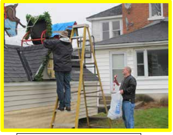
Adding decorations to the float.