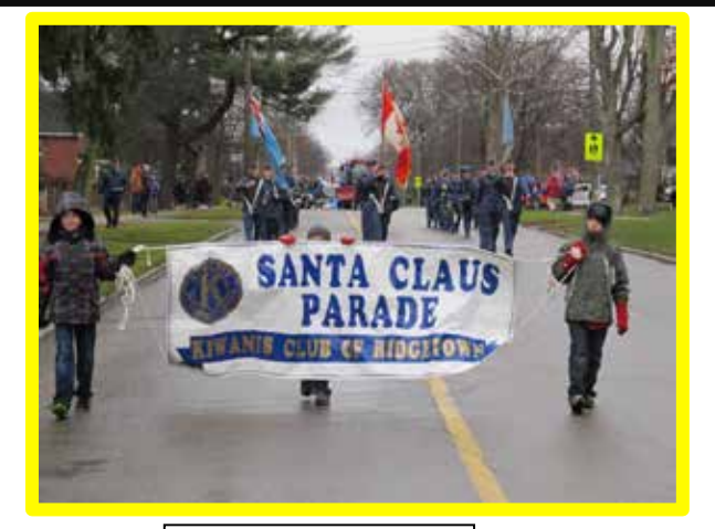
The parade begins!