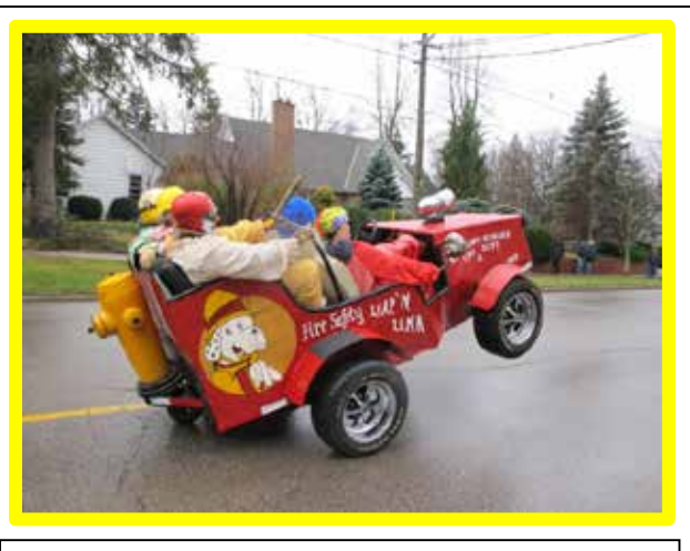
Ridgetown can't have a parade without Leap'n Lena!