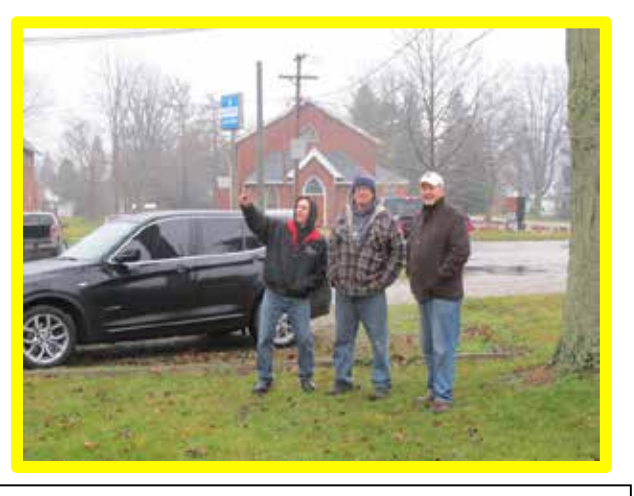
Supervisors telling him where to put the decorations.