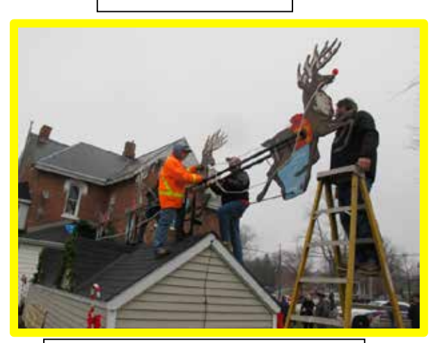
Getting the sleigh ready for Santa.