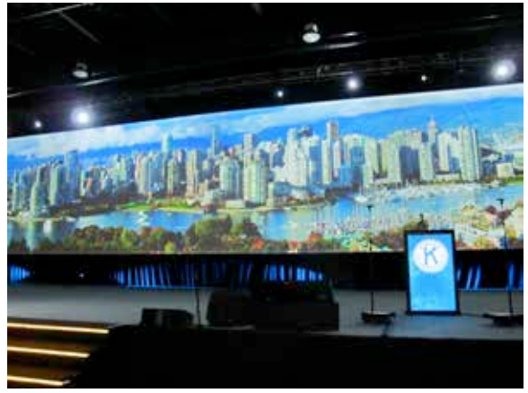
The stage is ready for the International Convention to begin in Vancouver.