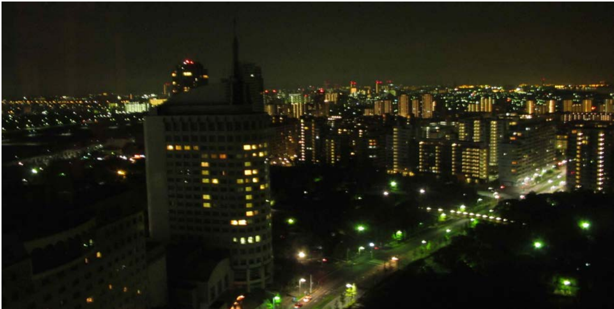
Night-lights of Tokyo