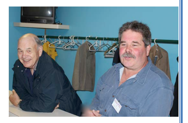
Cheering on the team