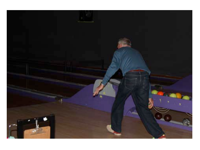
Just like this