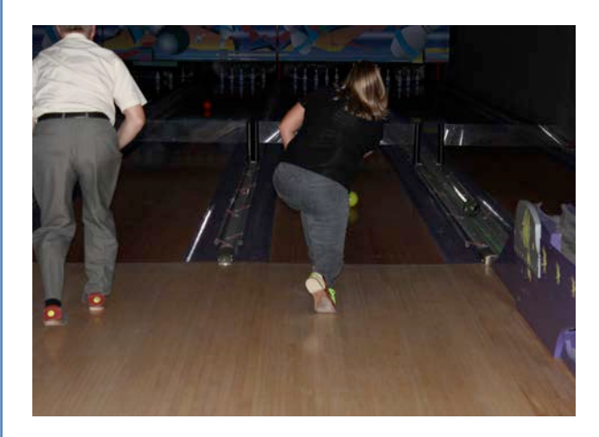
Their best sides